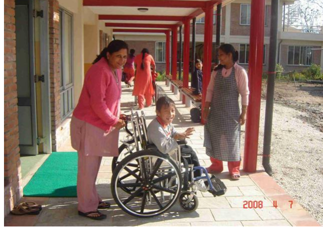
De kinderen vinden de nieuwe school prachtig