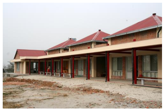
School voor speciaal onderwijs 1ste fase