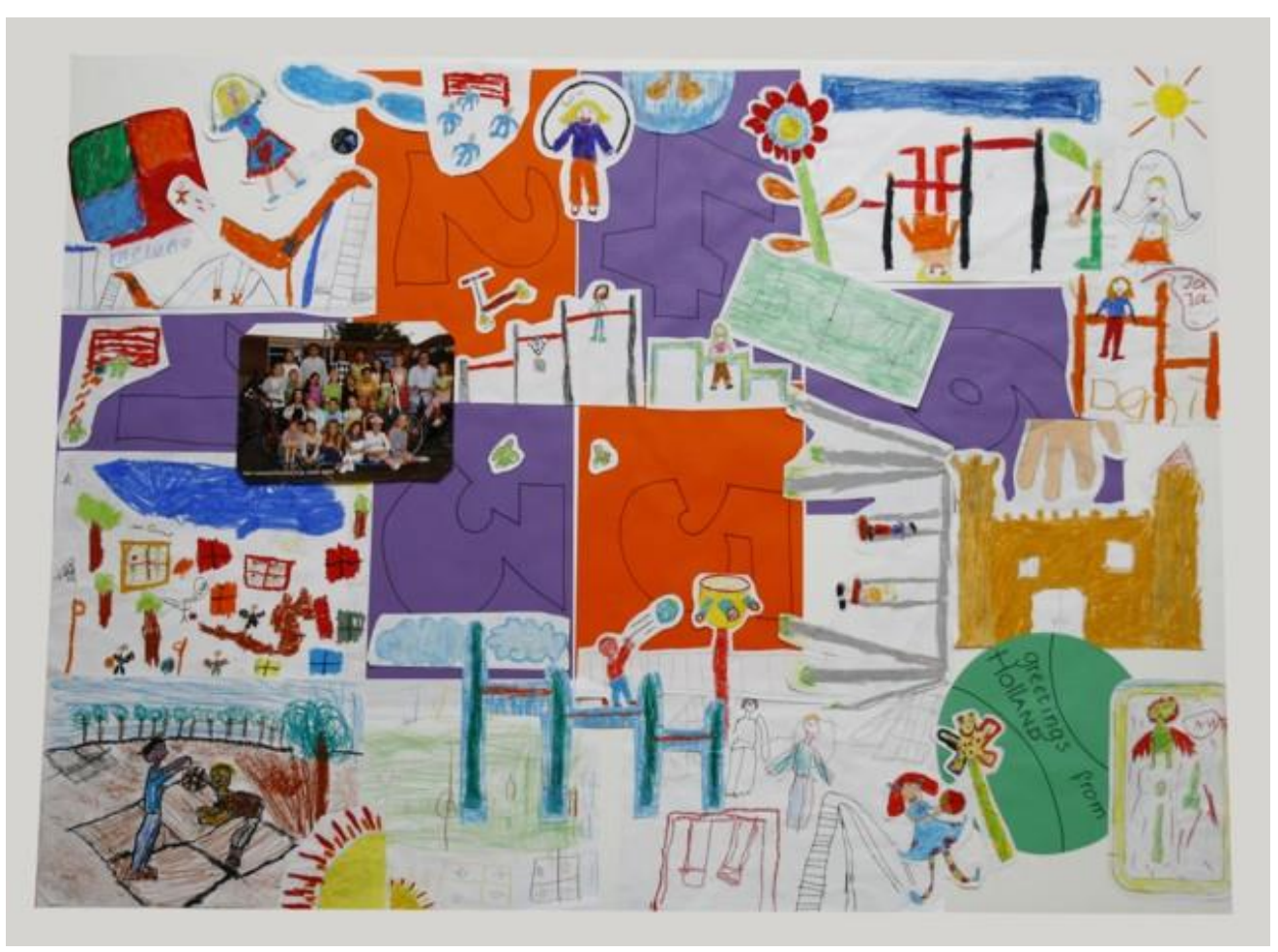
Kinderen van de Van Leeuwenhoekschool uit Hilversum maken kunstwerken voor de school in Kathmandu