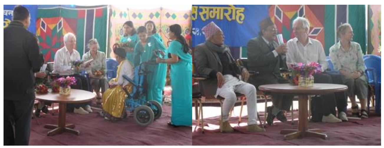
Ceremonie van het leggen van de fundering