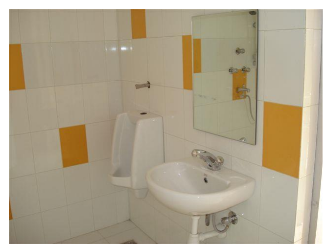
Het sanitair wordt gesponsord door stichting Maha Mata.