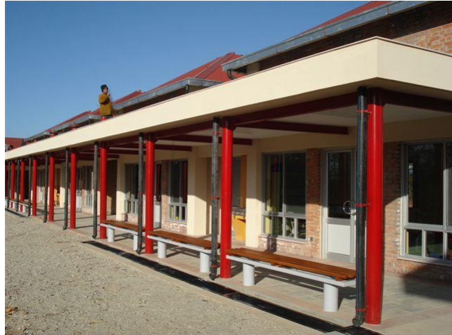
De Ireland Bhawan (gebouw) schittert in de zon!