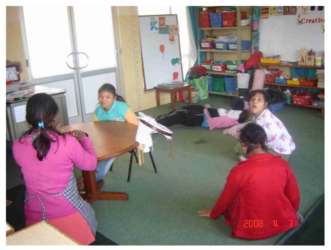
De kinderen maken dankbaar gebruik van de school