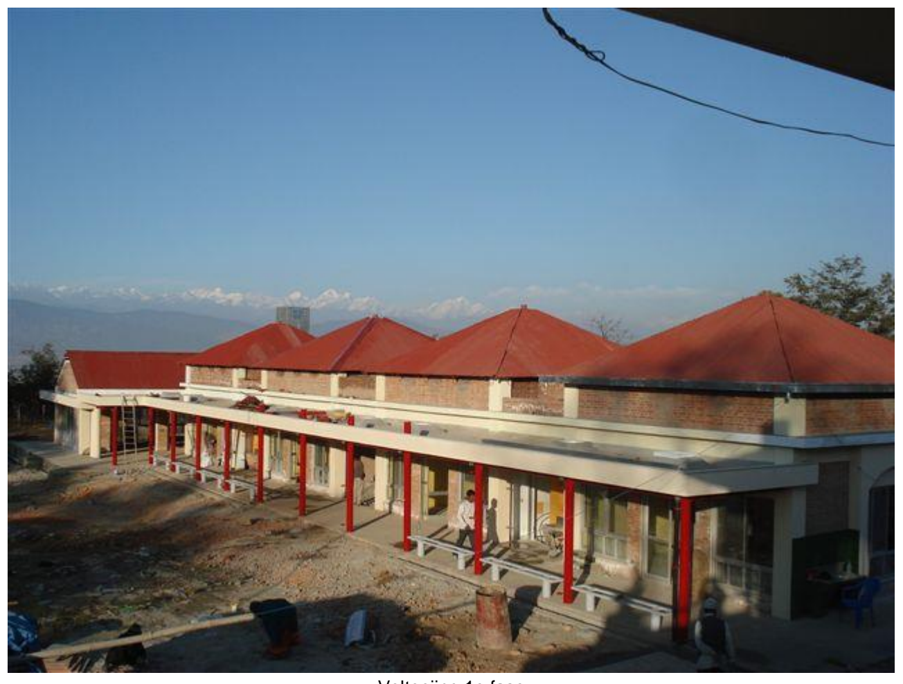
Voltooiing 1e fase